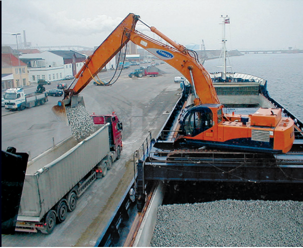
DISCHARGING SPLIT TO LORRIES

Contact this vessel +47 476 85 786 famita@misje.no