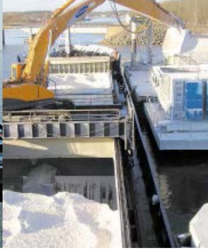
DISCHARGING TO HOPPER